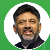
Shri D. K. Shivakumar Hon'ble Deputy Chief Minister Government of Karnataka

future cities a 360 degree event on city development