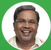
Shri Siddaramaiah Hon'ble Chief Minister Government of Karnataka