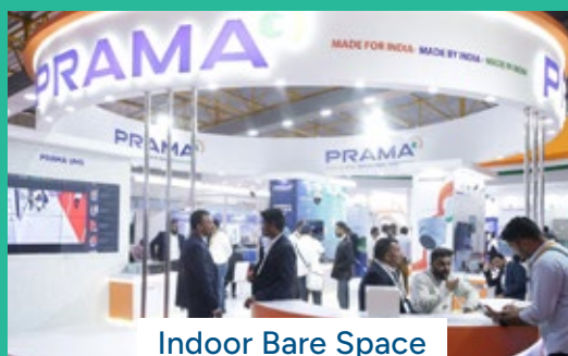
Indoor Bare Space