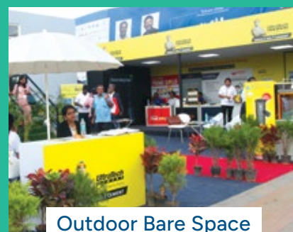
Outdoor Bare Space