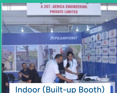
Indoor (Built-up Booth)