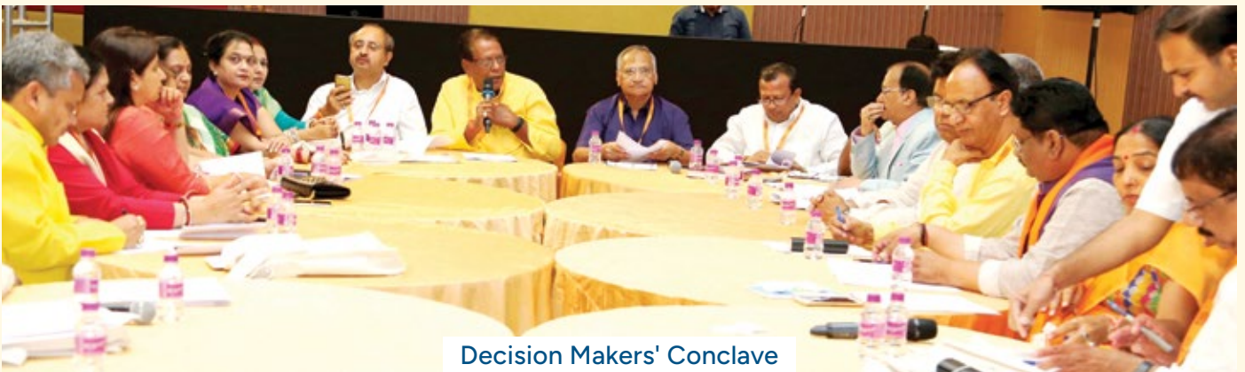
Decision Makers' Conclave